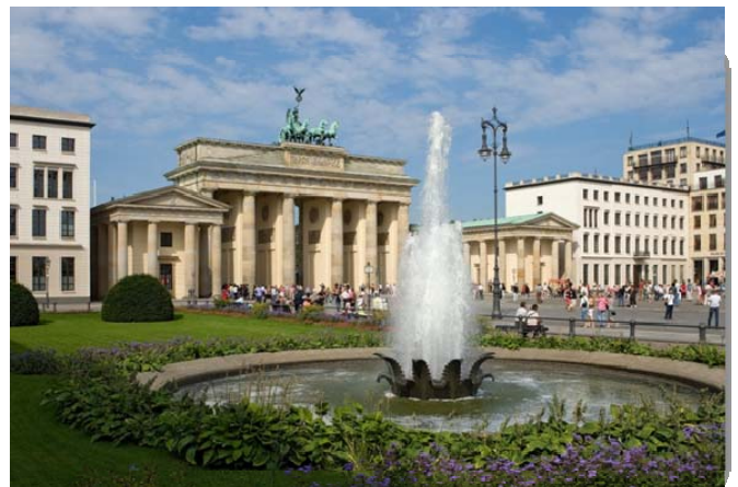
Unter den Linden/Brandenburger Tor

Berlin, which is situated in the Centre of Europe, has one of the most lively culture scenes in the world. The German capital is well known for its historical heritage and internationality. With its atmospheric cafes and bars, its numerous museums it has become a popular tourist destination as well as an inspiring conference location.