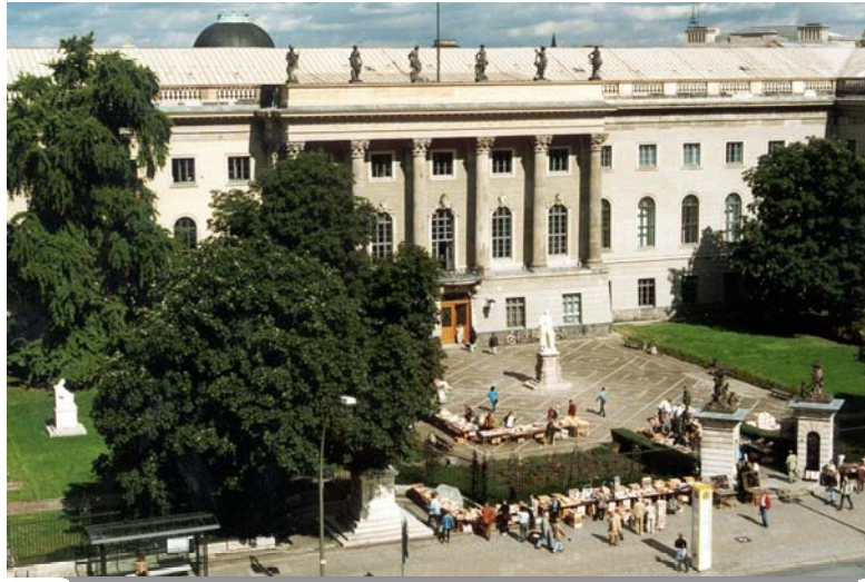
Conference venue: The main building of the Humboldt University Berlin